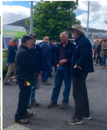
it must be important?