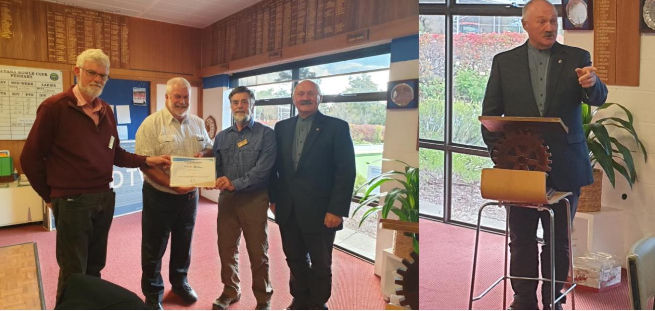
Congratulations to all Members – this is recognition for all of your outstanding contributions!