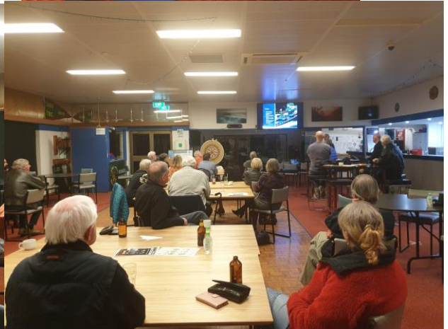
Members of the Public were invited to this talk and it was great to see that a few came along