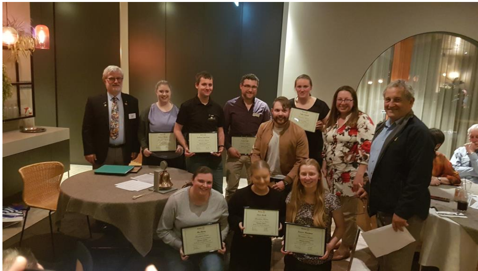
New Clarence Sunrise members

There were approximately 40 people there to celebrate, including the District Governor, the District Governor Elect and the District Membership Director.