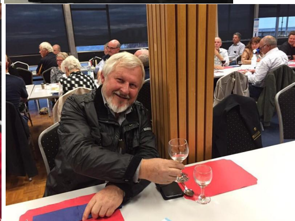
2 "Poles" practice "Social Distancing"