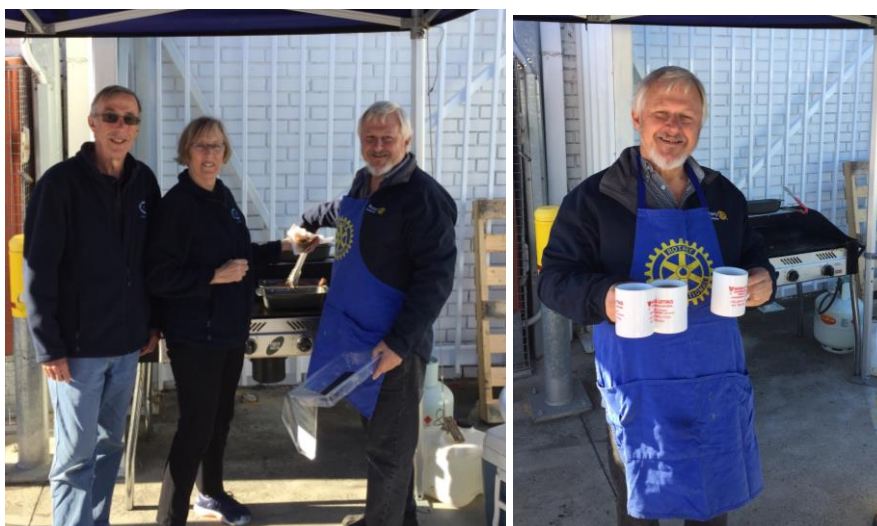
RCOL Members working hard at the Brierley Fundraising BBQ!