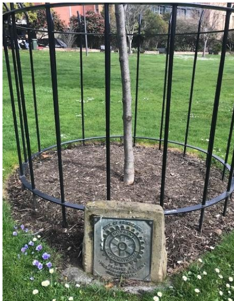
Site of a tree planted by Paul Harris in 1935 in St Davids Park