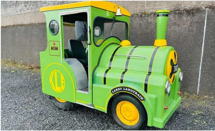
Larry Landtrain has been proposed as a Covid-secure and child-friendly way of transporting visitors.

Unholy row erupts over Larry Landtrain taking visitors on Lindisfarne Council scraps four-week trial of alternative to existing shuttlebus after swift and fierce opposition