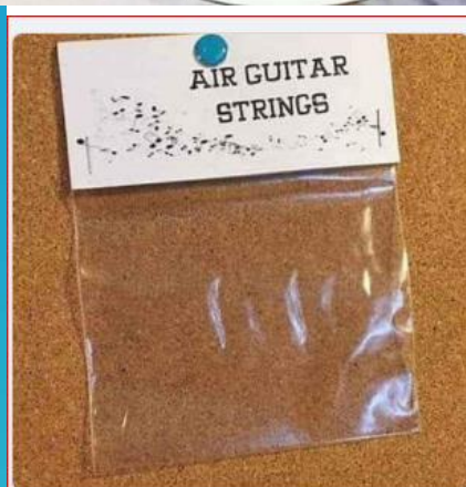
$201 Rare and verry hatd to find Launceston, TAS

DOES ANYONE ELSE WISH THE MANUFACTURERS WOULD WRITE SHAMPOO AND CONDITIONER IN A BIGGER FONT SO WE CAN READ IN IT IN THE SHOWER WITHOUT OUR SPECS !!