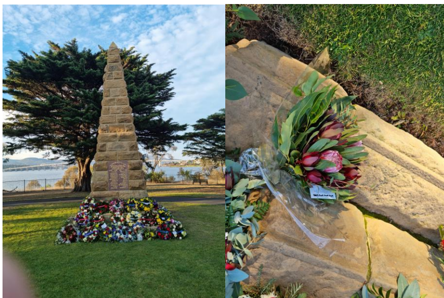
RCOL Wreath laid on Anzac Day