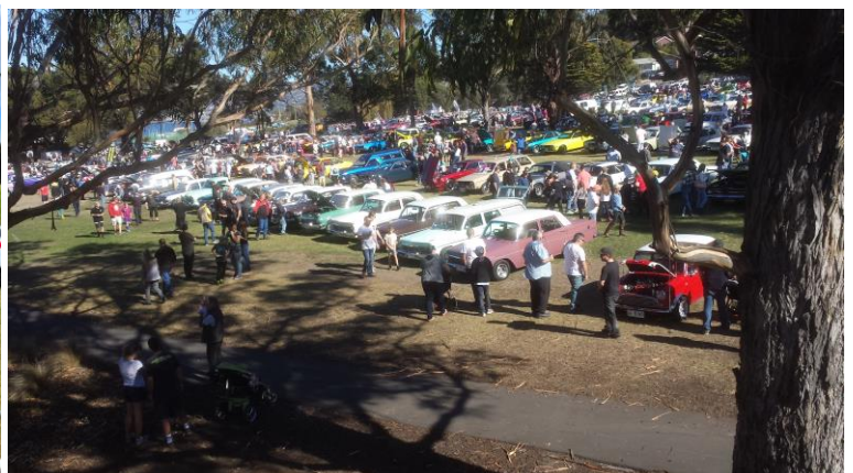
The new marquee in use at Shannons last Sat....not quite the same event as 6 years ago!!