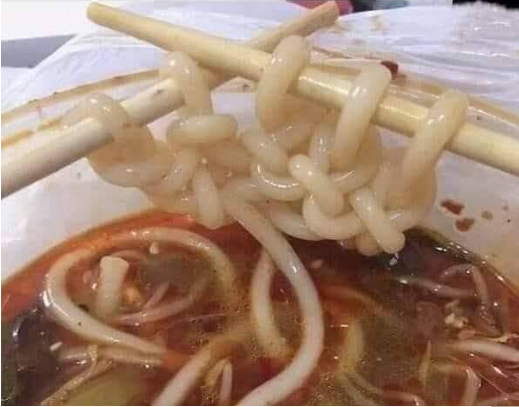
Took Grandma to the Chinese restaurant...

ARE YOU SWEATING WHILST PUTTING PETROL IN YOUR CAR FEELING SICK WHEN PAYING FOR IT? YOU PROBABLY HAVE THE CAROWNER VIRUS