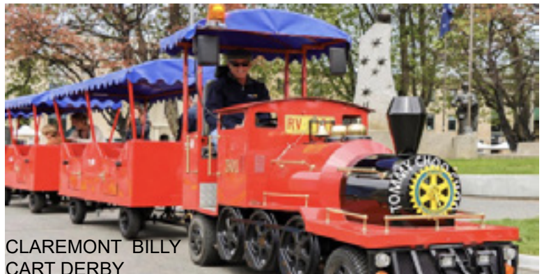
CLAREMONT BILLY CART DERBY