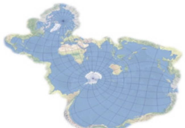
World map according to fish

Meetings are held on the first & third Wednesday of the month