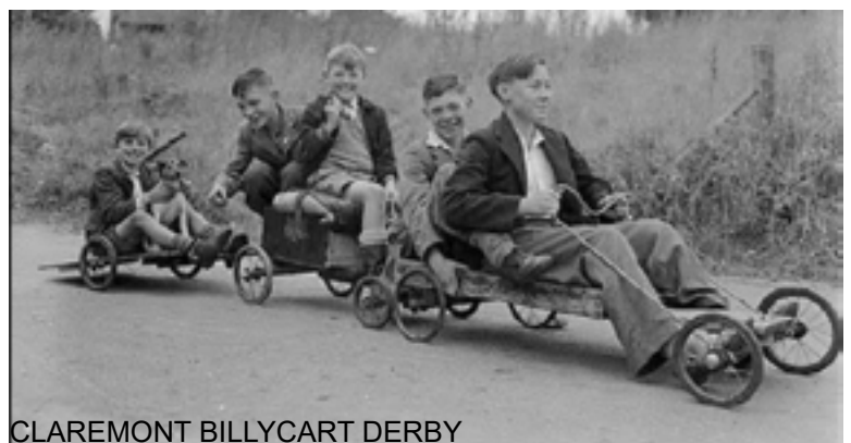
CLAREMONT BILLYCART DERBY