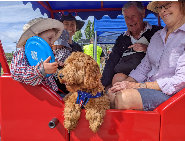
Sandy Bay Regatta - 26 January, 2023