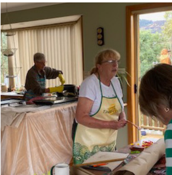
3. Melt the BeesWax mix - this takes time