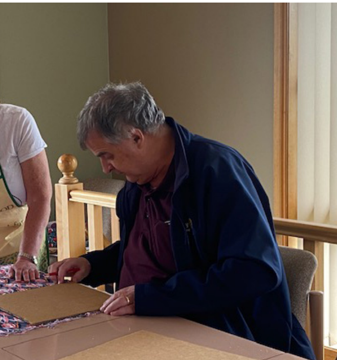
2. Carefully... measure and cut the fabric