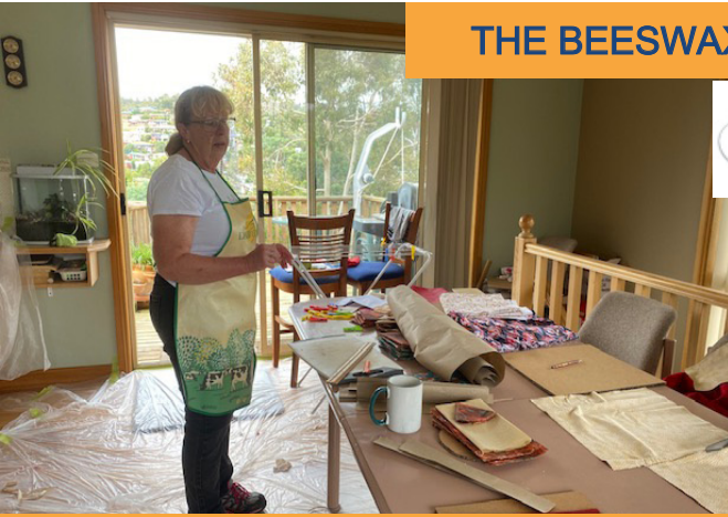
1. The set up - note the floor!