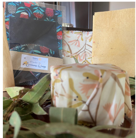
5. Put to good use