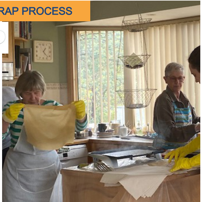
4. Coat the fabric in the beeswax then hang it out to dry