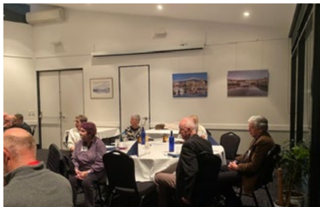
Moonah visits Lindisfarne