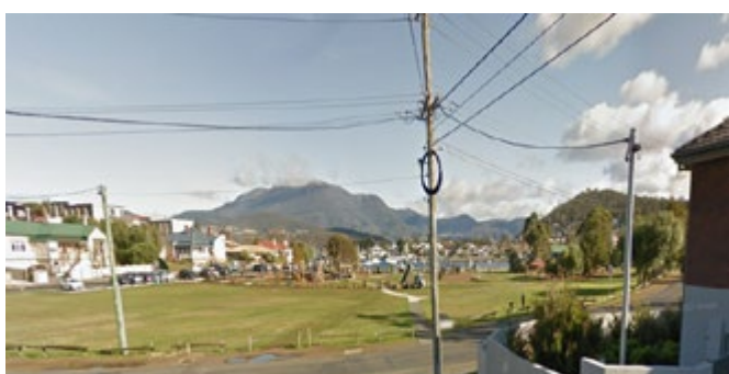
Lindisfarne Bay 2015