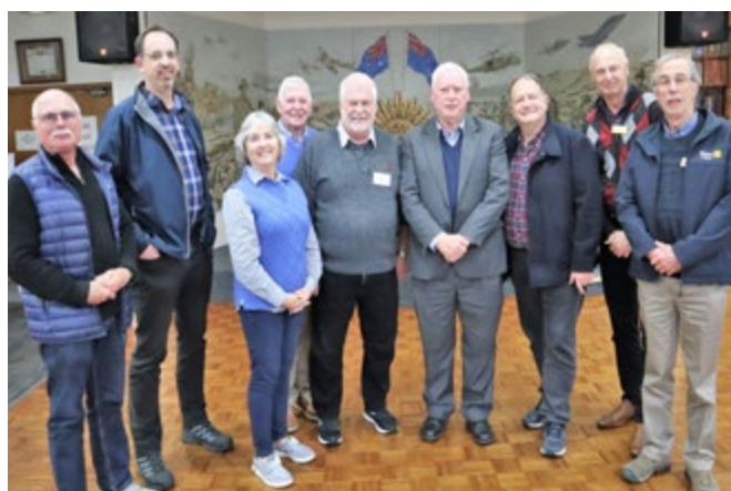
Lindisfarne visits Claremont