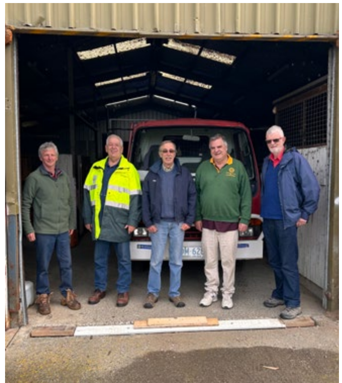
Tommy is now at his new stable at Elwick.